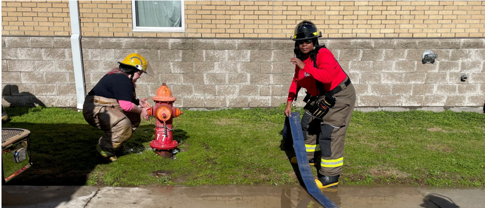
Photos are from "Introduction to Firefighting Training" held in Rosedale.

December – Bayou Sorrel/Bayou Pigeon – May Day Drill/Communications